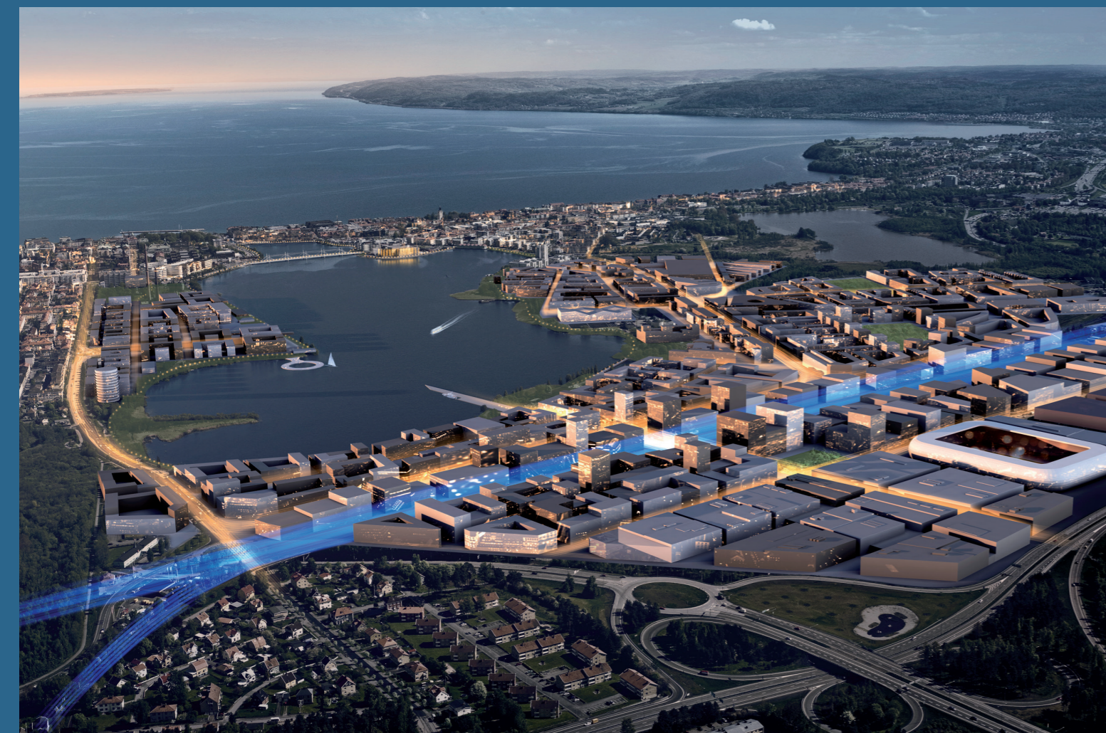
Future vision of Södra Munksjön.