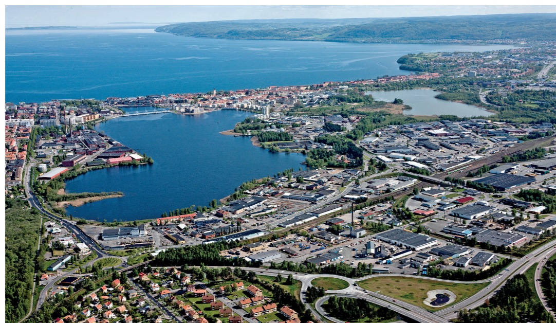
Photo taken from the southwest over the area as it currently looks.

Sveriges Arkitekters rekommendation kring sekretess, PM, november 2015