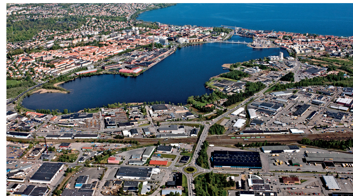
Photo taken from the southeast over the area as it currently looks.